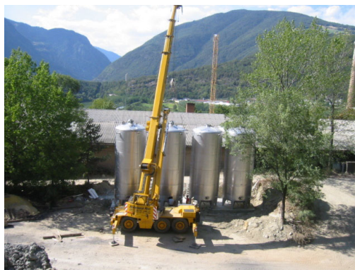
Figure 6: Building of the pilot plant

A second biogas plant, based on the patented Gasser ECOGen process, is built and put into service: