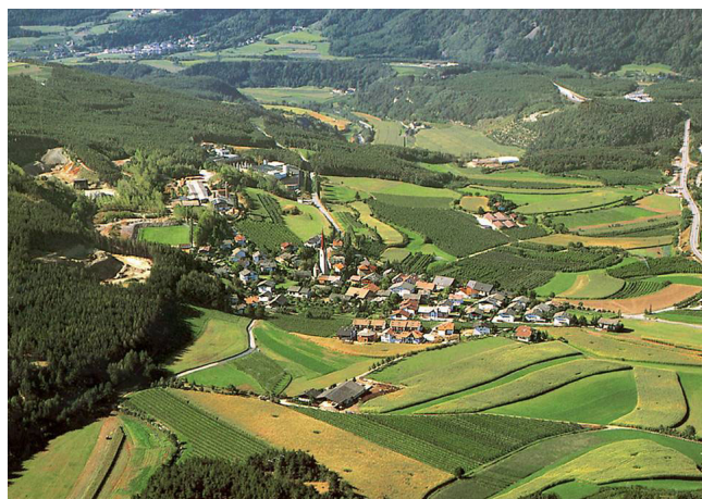
Figure 2: Aerial view of the brickyard (on the left the brickyard – village of Sciaves to the right)

Gasser tries hard to be a socially responsible corporate citizen. Good relations have been established with all stakeholders since the Gasser company has been established in 1889. In the early days the brickyard used to be the only employer in the area then granting a place of work to more than 100 people.