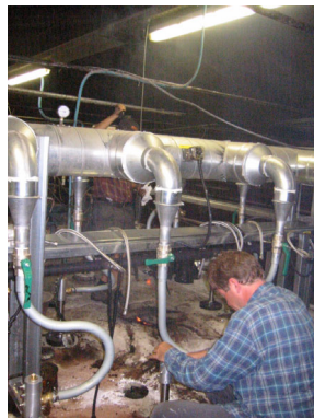
Figure 5: Installation of new dual fuel high speed burners

A second biogas plant, based on the patented Gasser ECOGen process, is built and put into service: