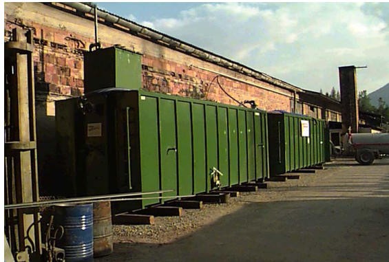
Figure 4: Containerized biogas test plant

The hitherto used #5 boiler oil is gradually substituted with rendering fat. With the end of the year no more fossil fuels are used in the brickyard.